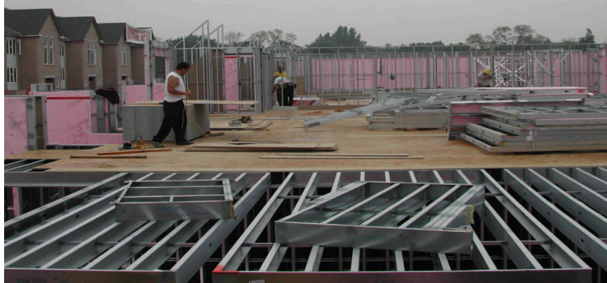
Hyde Park Condominiums (Zentil): Genesis™ steel panels and roof trusses made from light steel framing contribute significantly to meeting several of the prime building considerations - quality, lightweight and speed of erection.

KML's Mifsud echoes those sentiments: "Whether your project is a nursing home, senior's residence, long-term care facility - all with an increasing demand for new beds - or whether you're in residential construction wanting to close homes sooner and collect earlier, pre-assembled Genesis systems speed up construction, reduce costs through direct and indirect costs like on-site waste and eliminate framing-related callbacks. That all adds up to value that any client we've ever met wants. And of course, the entire system is built around light steel framing, which has quality advantages over alternate building materials."