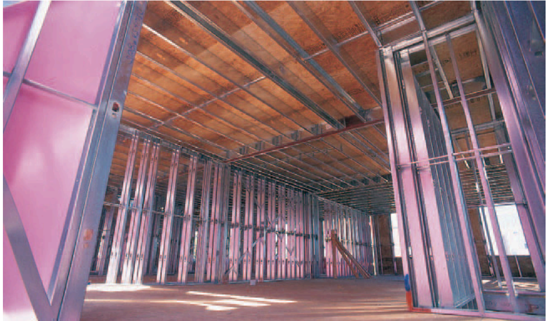
King West Village (Urbancorp): Extensive use of light steel framing, both structural LSF sections and non-loadbearing, was a feature of this four-storey project.

Some improvements in residential and commercial construction are mainly cosmetic, some enjoy more substance. Whether visible or not they add value to a project. Value is, of course, in the eye of the beholder. People will differ on what constitutes aesthetic improvements. But what no one argues about is that if you can improve the performance of a structure and save money at the same time, you have indeed created value.