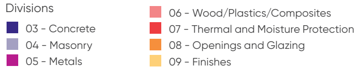
Tally® LCA Results

Results from the life cycle analysis showed both designs were comparable in total values across four of the five impact indicators. The steel-based design showed a significant advantage in global warming potential (GWP), saving approximately 1.1M kg of CO 2 eq or 15% when compared to the concrete design. This is equivalent to taking 220 vehicles off the road to save on annual emissions. This is primarily due to the 27% weight savings in the steel-based design. Concrete used in both designs was the largest material contributor across the five environmental impact indicators.